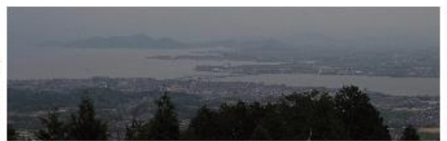
Biwako lake in Shiga